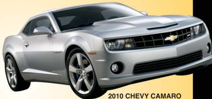
2010 CHEVY CAMARO

Join us at Convention and drive away a winner!