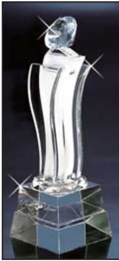
Runner-up Founder's Excellence Award