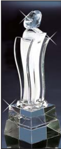
1st Place Founder's Excellence Award