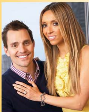
Bill & Giuliana Rancic Spokespersons for the Starlight Children's Foundation Bracelet campaign